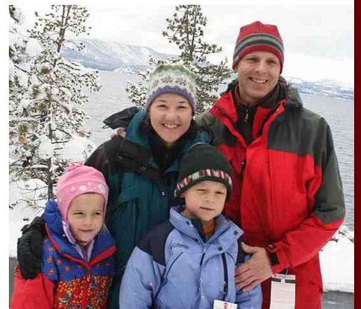
The Bacho's enjoying a wonderful time in the snow.